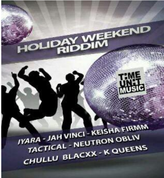
HOLIDAY WEEKEND RIDDIM