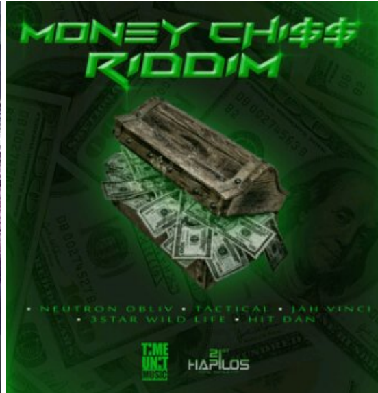
MONEY CHISS RIDDIM