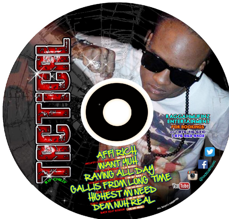
ARTWORK: Tactical 2014 Promotional CD

https://www.youtube.com/watch?v=MOB8X11XVyE (MUSIC VIDEO - AFFI RICH)